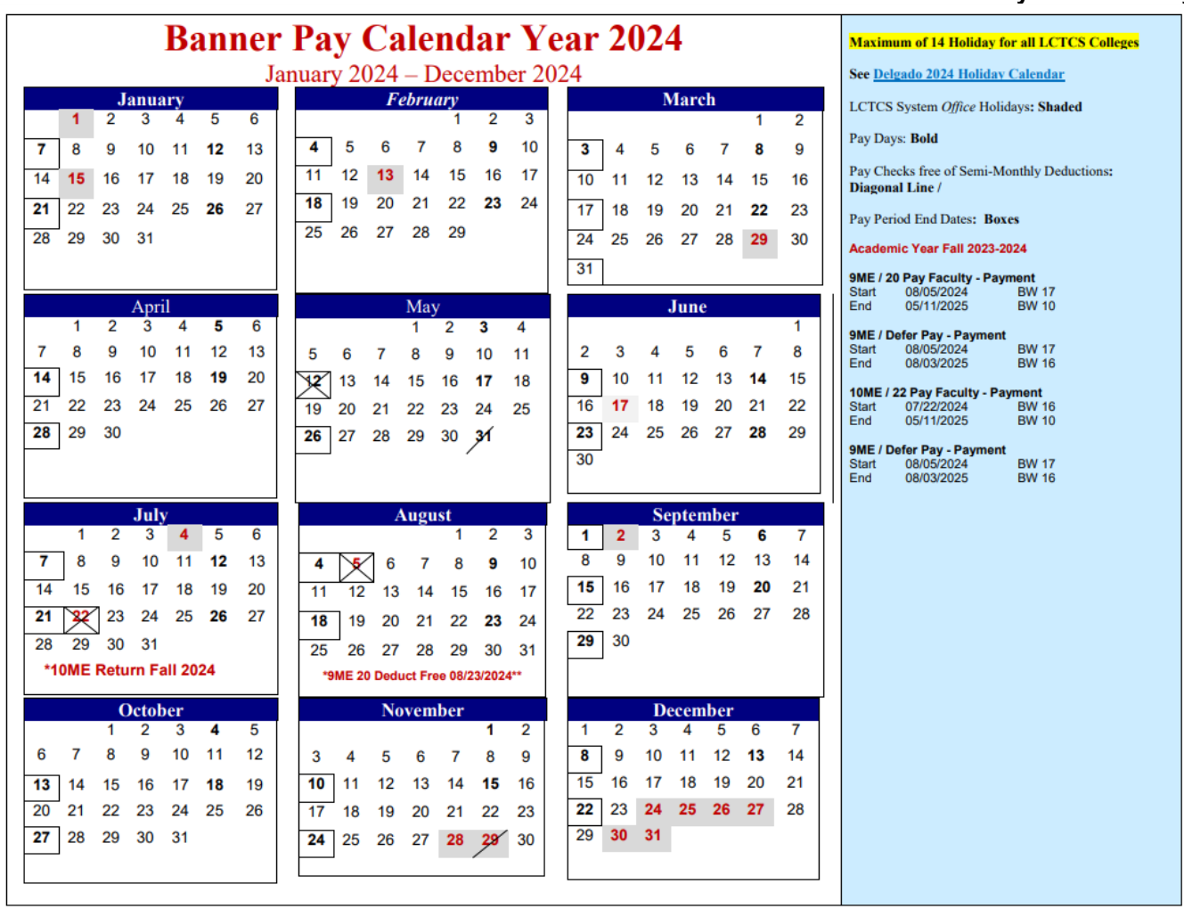
Payroll - Biweekly by Calendar Year 2024